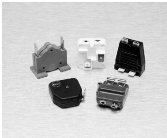
Motor Start Relays