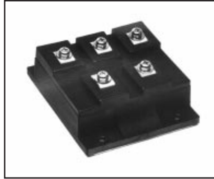
ME600815 Three-Phase Diode Bridge Modules 150 Amperes/800 Volts