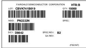
F63TNR Label sample